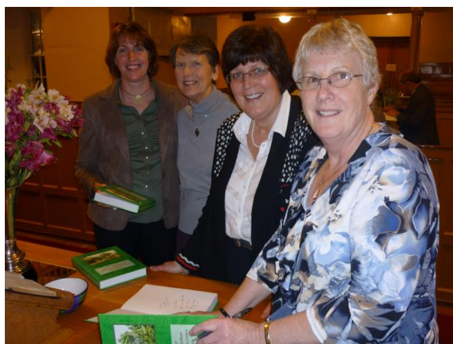
Members at the Book Launch

Everyone who worked tirelessly and with loyalty to ensure this event was the success it was must be thanked and congratulated. Many guests remarked on how the congregation positively uses its building. Books are still available for purchase.