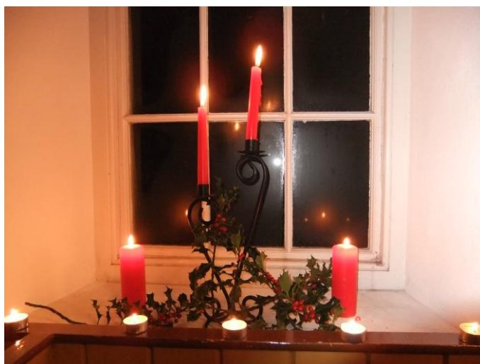
Candlelight in the Church