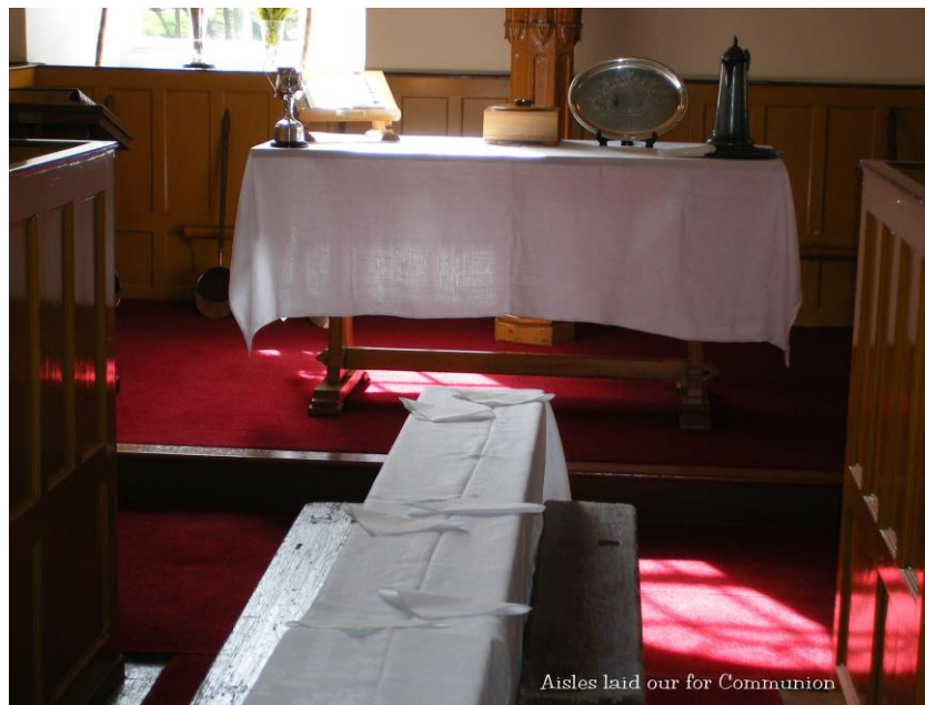
Tables laid for the Communion Service