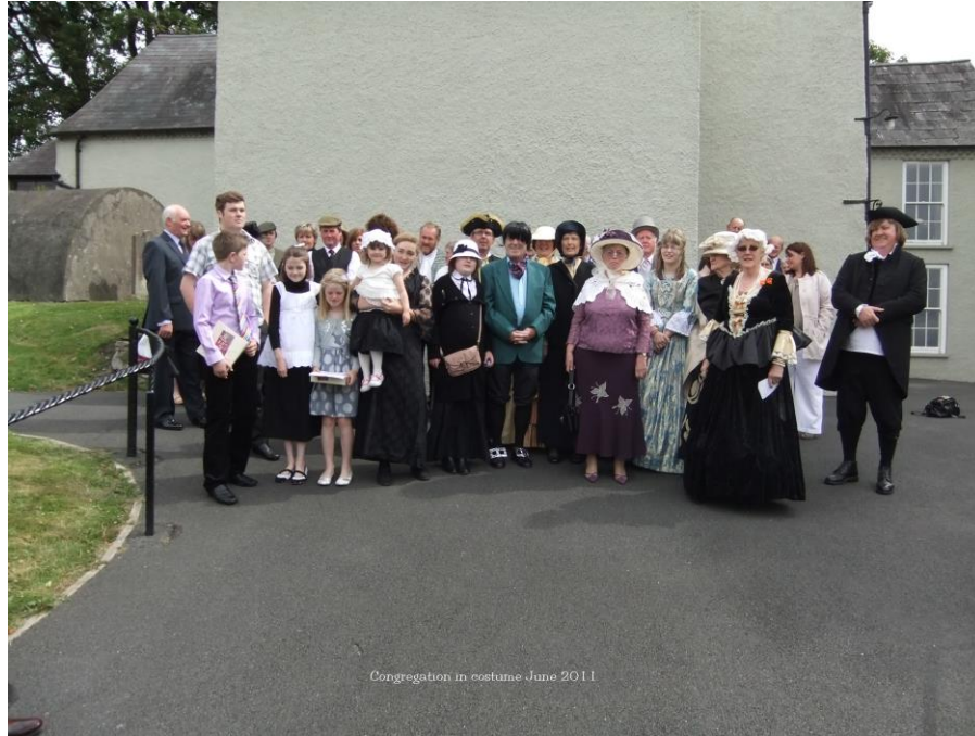
Congregation in costume June 2011