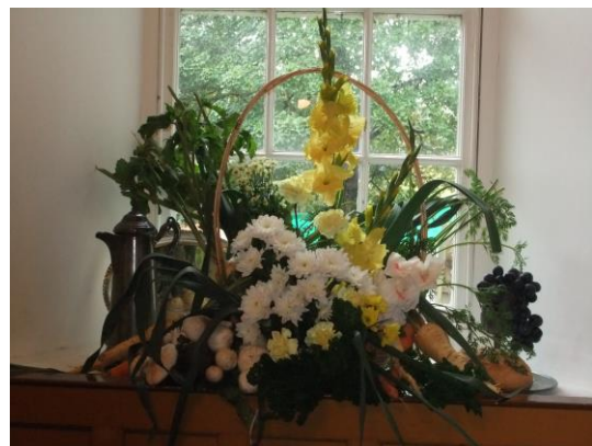
Harvest Thanksgiving Arrangements