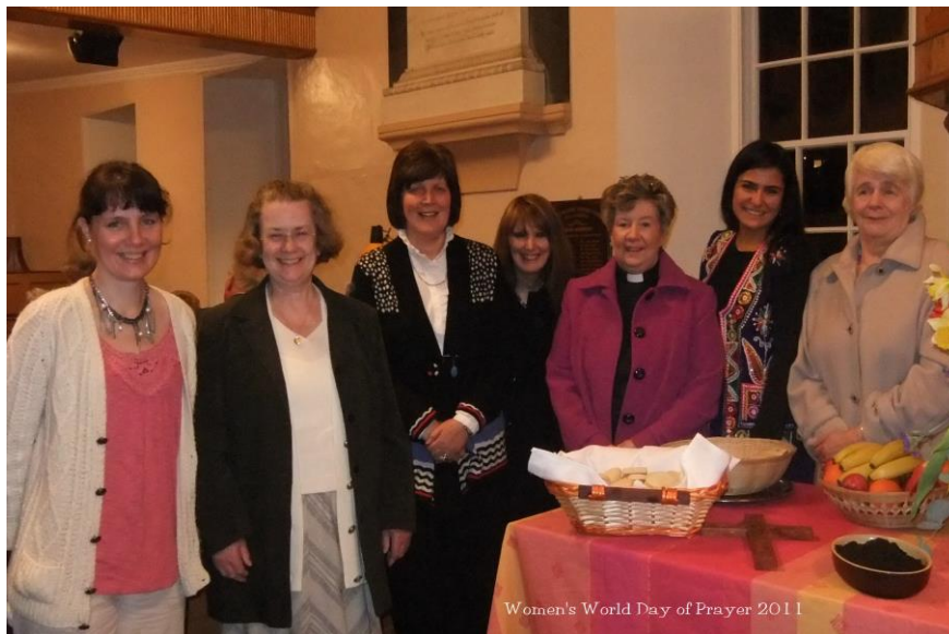
Special Readers at the Women's World Day of Prayer Service