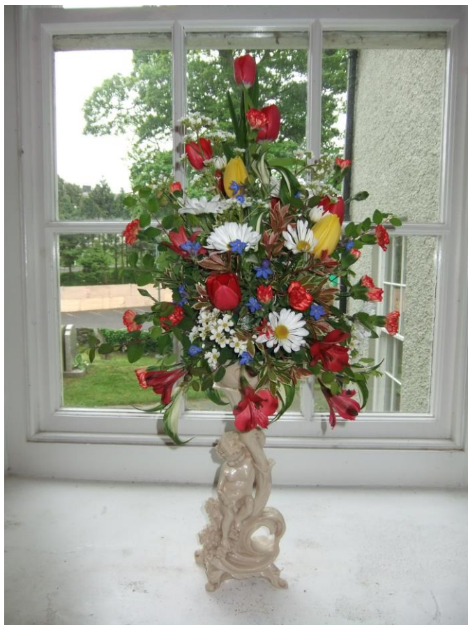
Special Flower Arrangement