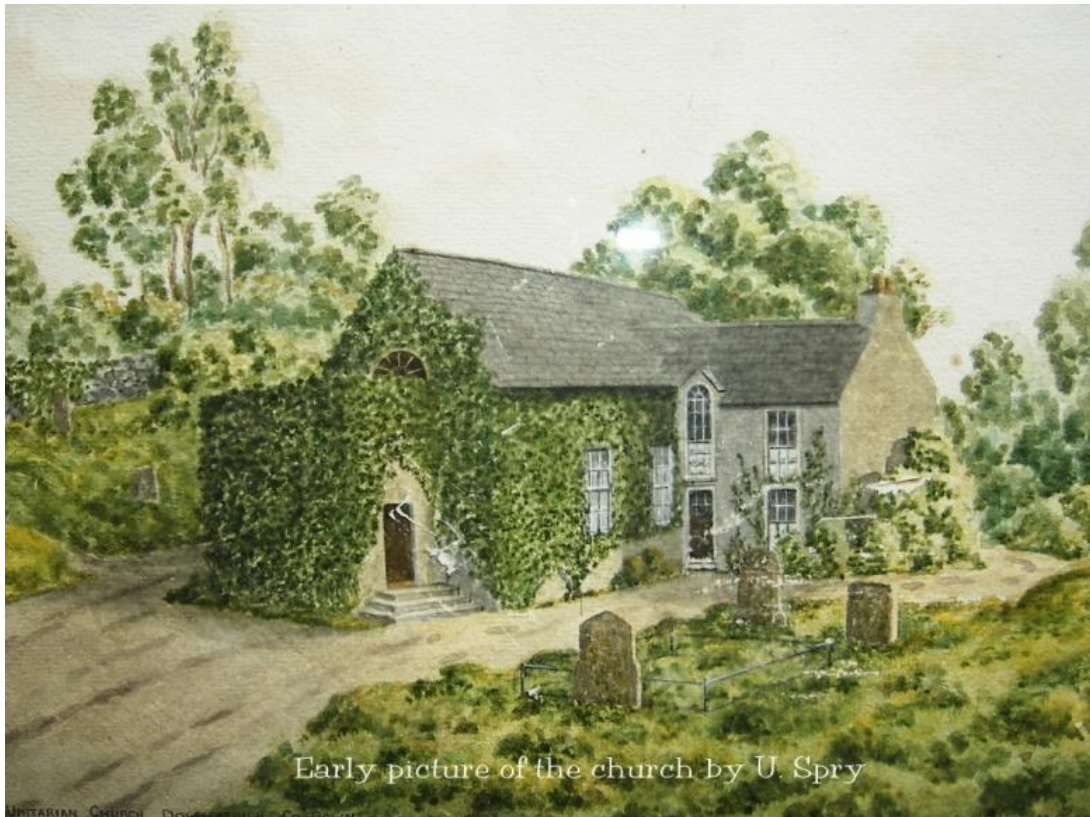
Early picture of the church by U. Spry