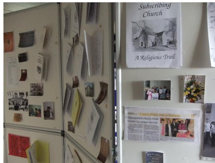
Historical Display at the European Heritage Open Days