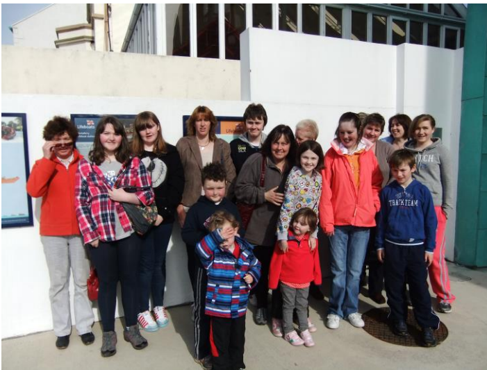
Members at the Visit to the Lifeboat Centre

The Non-Subscribing Presbyterian Church Downpatrick had hosted a joint service in January with Ballee and Clough Non-Subscribing Presbyterian Churches and Downpatrick and Ardglass Presbyterian Churches. On Saturday 9 th April 2011 representatives of these churches visited the Portaferry RNLI Centre where they presented a cheque for £650 from the church collection. Everyone was able to get aboard the Blue Peter Craft, to try on the equipment and tour the premises. The Commodore and his staff explained the working of the station and following refreshments everyone was given souvenirs. It was most informative to know how the donation could help the work of these brave volunteers.