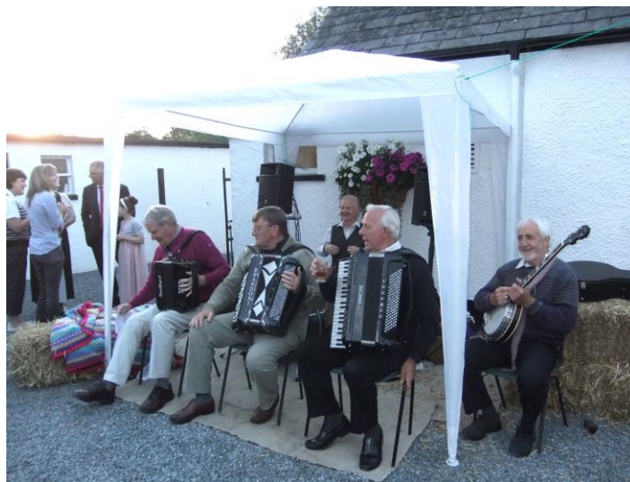
Musicians at the Treasure Hunt