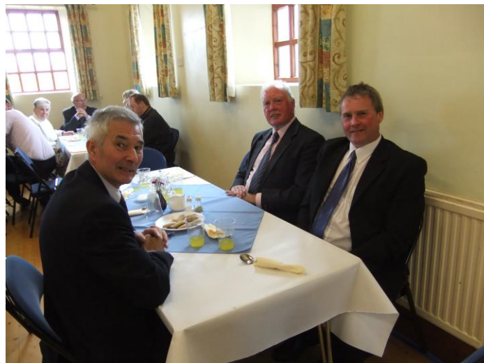
Buffet Lunch in Ballee following United Service