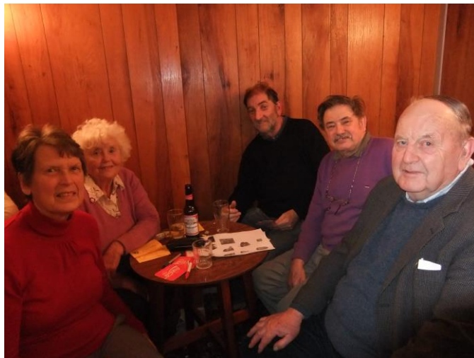
'Inchworms' The Winning Team at the Table Quiz