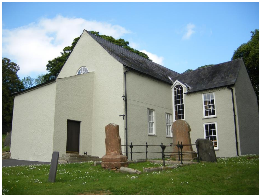
Our 300 Year old Church in 2011