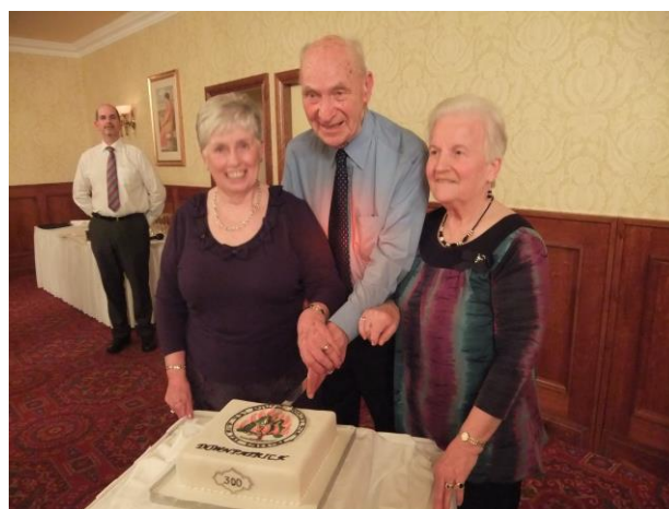
Cutting the Anniversary Cakes